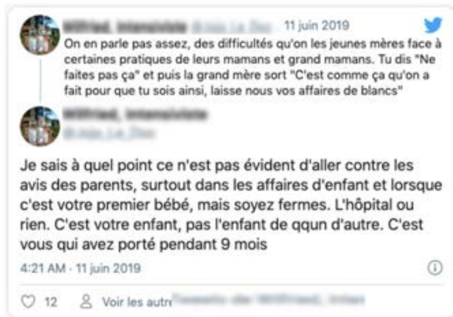
FIGURE 4. SOCIAL MEDIA PROVIDES INSIGHTS INTO ATTITUDES AND BEHAVIORS

Preliminary findings from social media and press coverage conversations provide insights regarding how young women feel social pressure to maintain traditional practices from older women related to pregnancy and childbirth. For example, as the tweets in Figure 4 show, some older women may encourage young mothers to avoid the hospital or to adopt cultural practices that may not be in the best interest of the child, and this pressure may be difficult to avoid.