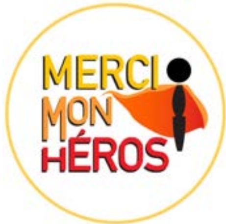
FIGURE 2. MERCI MON HÉROS