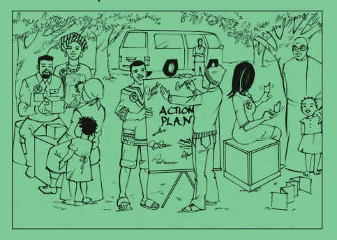
Step 8: Reflecting on Your Community's HIV Actions