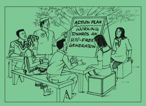
Step 7: Using the Toolkit to Implement Your HIV Action Plan