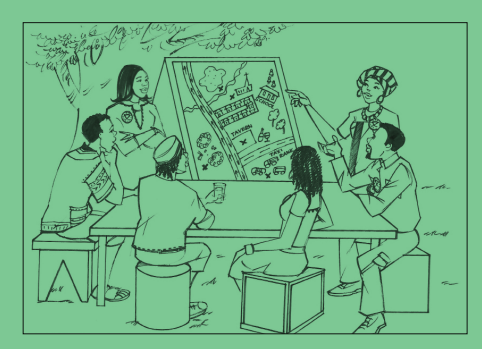
Step 4: Finding the Information We Need