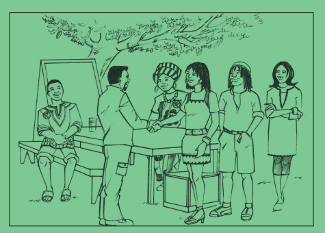
Step 3: Consulting the Community Together