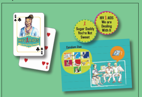
Step 7: Using the Toolkit to Implement Your HIV Action Plan