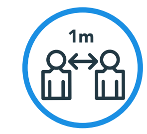
Practice physical distancing by maintaining 1 metre distance between you and others