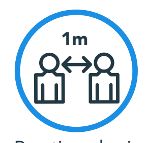
Practice physical distancing by maintaining 1 metre distance between you and others