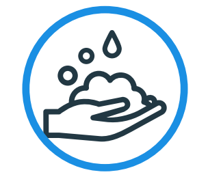
Frequent handwashing with soap for at least 20 seconds

We protect each other by: practicing physical distancing, staying at home (if you don't feel well)