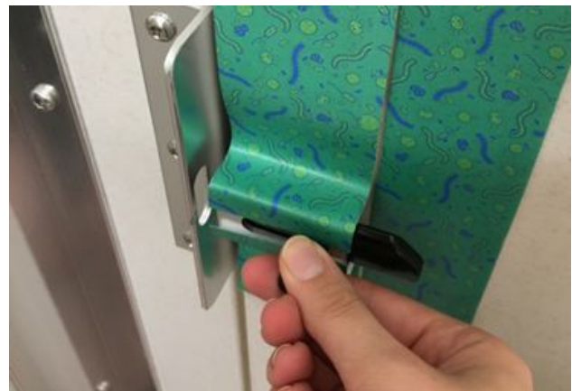
Left image: Dreibelbis et al. Right image: Nudging kids .