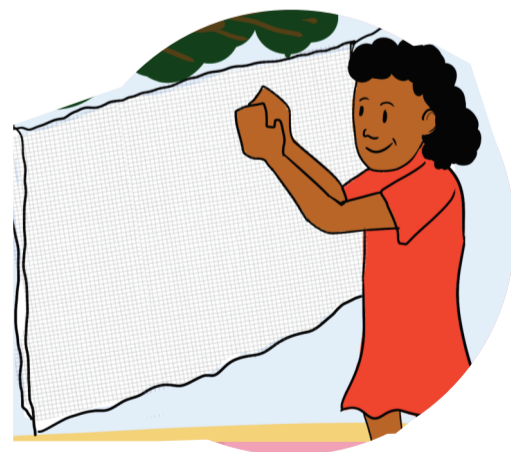
Airing to dry