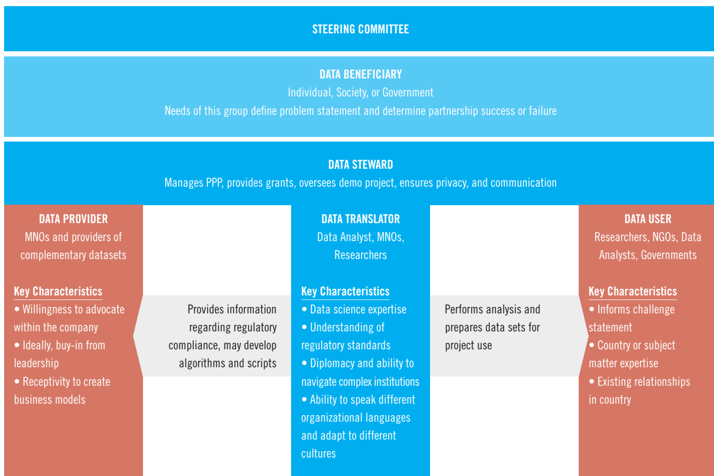
Figure 2. Primary Roles within a Partnership for a Mobile Data for Social Good Project

An operational mechanism is needed to hold the project’s vision, and rapidly execute on the roadmap plan while ensuring the ongoing involvement of multiple stakeholders and implementers. Public-private partnerships have been created in many sectors to provide collaborative and effective operational leadership. Figure 1, describes a possible organizational structure for a partnership.