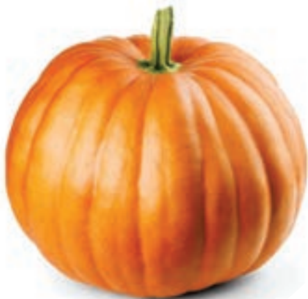
PUMPKIN Nkpuru ugwu