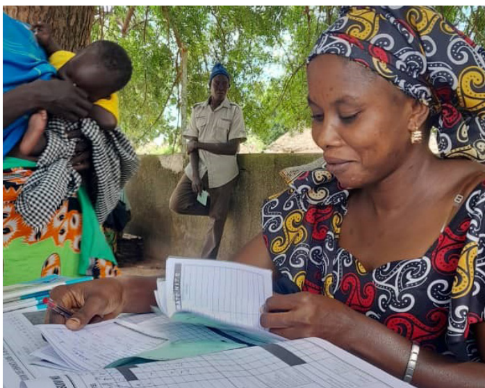
A community health worker completing a vaccination register in Kaffrine, Senegal. Photo Credit: USAID Senegal BRHS project. 2022

BRHS selected the Kaffrine Region for the pilot because its vaccine rates were lower compared to the national average and due to the region's leadership's expertise and prior experience implementing RBF mechanisms in the health sector. Low vaccination rates in Kaffrine can be attributed to challenges in both vaccine supply and demand. Supply-side issues included stockouts of the vaccine when it was first available to the public and nurses being concerned about opening five-dose vials to prevent wasting any doses that might remain at the end of the day. On the demand side, misunderstanding about vaccines was widespread among the general population — including health workers. Misunderstanding arose due to poor communication and inconsistent messaging, varying opinions about the value and effectiveness of vaccinations being perceived as uniquely for children, and the country's relatively low COVID-19 incidence rate, leading people to believe that vaccination was unnecessary.